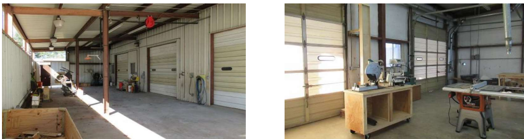
Fig. 1. The concrete lab facility for the selected class

The class that is involved in this study is a required course for BSc students in Construction Management in the department of Engineering Technology at Sam Houston State University SHSU or Sam. The department of Engineering Technology has an enrollment of more than 550 students and the Construction Management program represent around half of the total enrollment of the department. The class selected for this study is Concrete/Masonry Construction containing 23 students with 2 females (9%) and 21 males (91%). The class is a lecture/lab course with 1-hour lecture and 3-hour lab per week. Figure 1 shows the concrete lab area that allows exposure to the machines and hands-on practices typically found in industry.